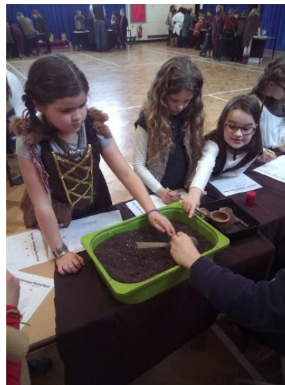
Year 4—Viking Day Activities

Finally, it would be remiss of me not to say another massive thanks for your generosity at the recent cake sale and mufti day; we raised just over £550—meaning our aim to create a new, quiet 'sensory' garden will be realised much quicker than we could have dared hope.